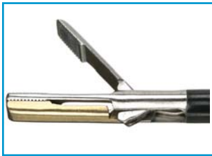
Upper Jaw opened by Silver Lever