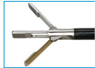
Press both Levers to open both Jaws