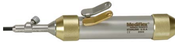
Above: Two-Lever System Operates Upper and Lower Jaws