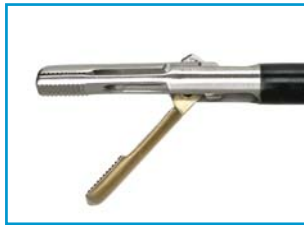
Lower Jaw opened by Gold Lever